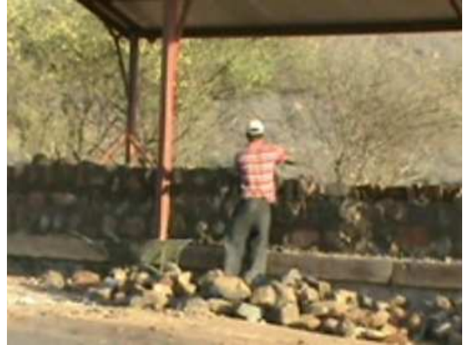
Walls going up!