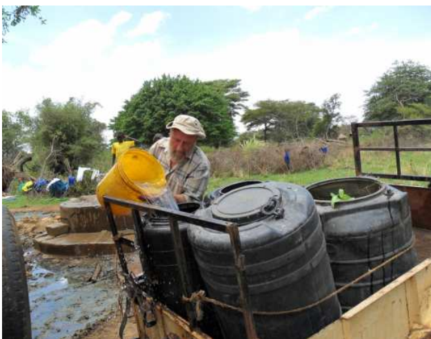
Hauling water from 10 miles away