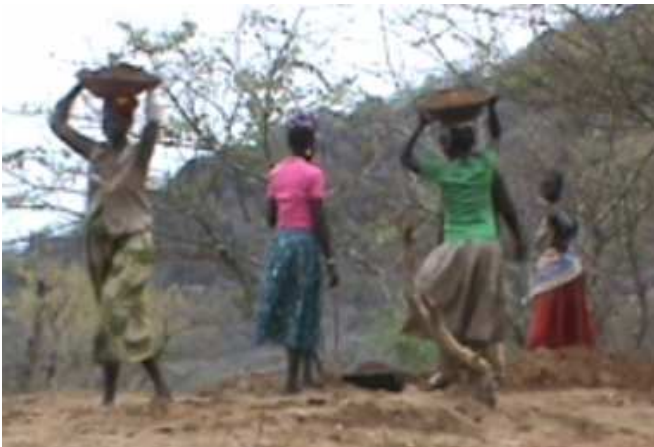
Women gathering rocks