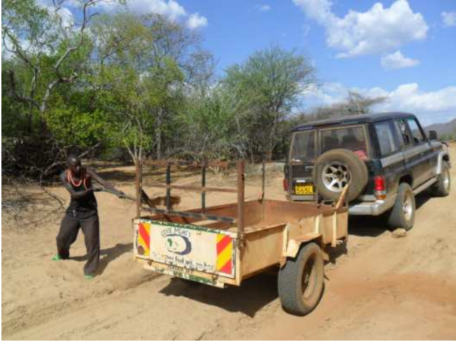
Getting sand from the dry river bed